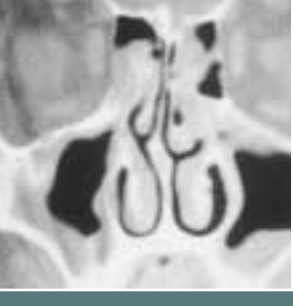
CT scan of normal nose and sinuses.

CT scan showing a typical appearance of a patient with acute infective sinusitus.